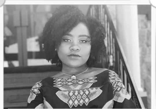
Gaytrix Solo College of the Holy Cross '21

"If it wasn't for CV I wouldn't have found the schools that were the best for me financially